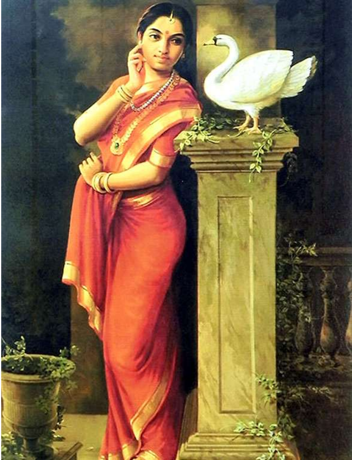
(Artist: Raja Ravi Varma Date: 1848-1906)