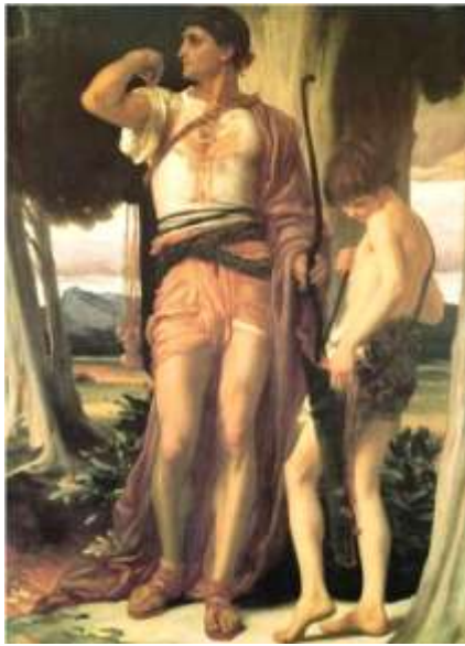
(Artist: Frederic Leighton Date: 1830-96)

He is veiled from the universal truth. Is he the person hiding in you! O mortal!