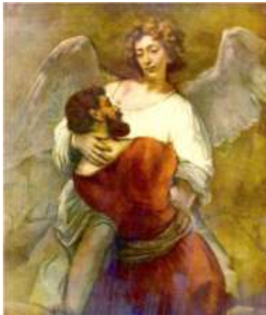
(Artist: Rembrandt Date: 1659)

He is ready to fight. Is he the person hiding in you! O mortal!