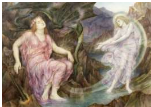
(Artist: Evelyn De Morgan Date: 1855-1919)

His reasons have flown. His senses have departed. He has shunned grace from his heart. He has shunned divinity from his soul. Is that you! O mortal!